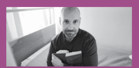
Thousands of hours of education, job training & counseling

Thank you for sharing hope & joy this Easter!