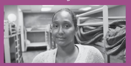
13,020 nights of shelter